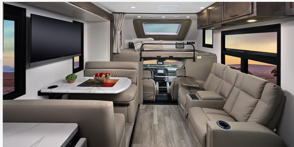
31KS with Driftwood II cabinetry and Milano II décor