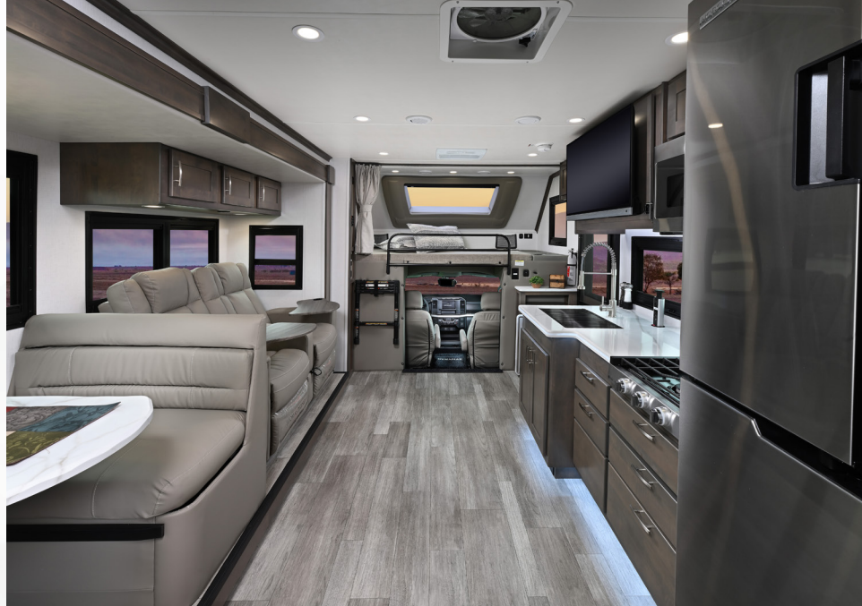
30FW with Driftwood II cabinetry and Milano II décor