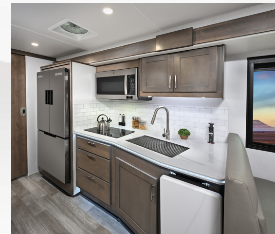
31KS with Driftwood II cabinetry and Milano II décor