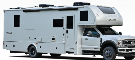
Platinum (Single Color Full Body Paint)