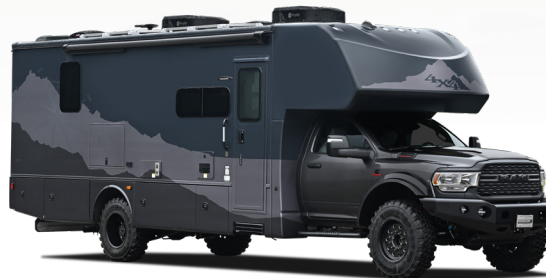
Shown in Xplorer Midnight

Available in Admiral Blue, Granite, Khaki, Magnetic and Merlot. Photos coming soon.