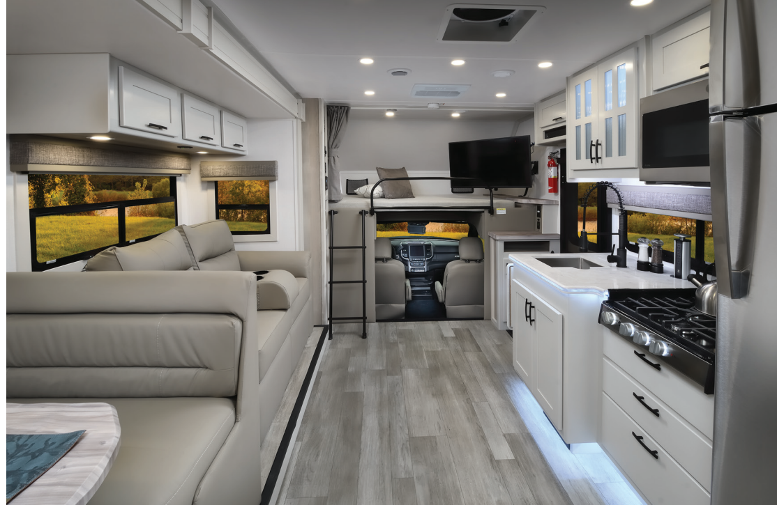
30FW with Mindful Gray cabinetry and Milano II décor