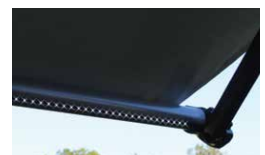
Power Awning with LED Light Strip Dual-Pitch, armless awning retracts automatically in high winds.

The "Soft-Close" feature keeps drawers closed during travel without plastic latches.