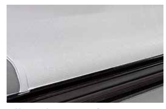
Fiberglass Roof This crowned, one-piece, fiberglass roof is more durable and easier to maintain than TPO or rubber.