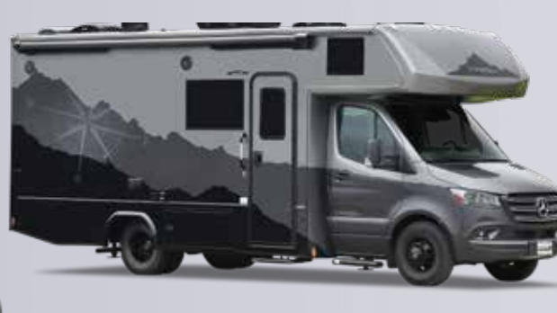
Shown with Freedom Edition Full Body Paint available in "Light" (Left), "Dark" (Right) or "Midnight" (to come).