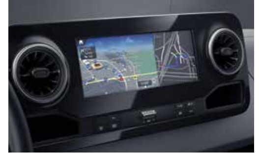
MBUX- Mercedes-Benz User Experience

The patented Oxygenics Engine supercharges any water pressure, turning weak flows into satisfying showers.