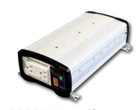
2000W Pure Sine Wave Inverter Power your AC devices without shore power or running the generator.