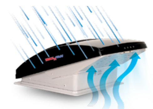
MaxxAir Fans Each standard fan features a built-in rain cover.