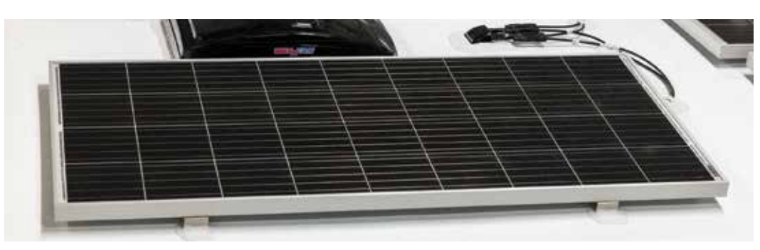
200W Glass Solar Panel Batteries last longer when they are properly charged. A roof-mounted panel provides a constant trickle of free power.