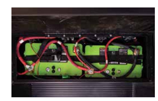
Dual Low-Temp Lithium Auxiliary Batteries (200Ah Total)

With a built-in heater, these batteries can charge at temperatures as low as -20°C.