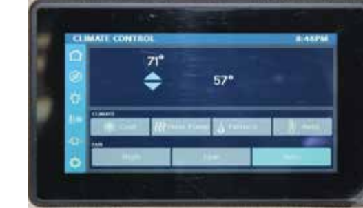
Firefly Multiplex Wiring Touchscreen Command Center,

10.25" Touch Screen with Smart Wheel Controls, Built-in Navigation, Apple CarPlay/ Android Auto, and "Hey Mercedes" Voice Control.