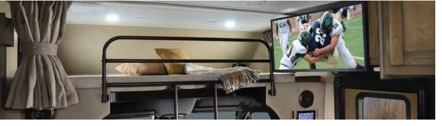
Cab-Over Bunk Option

Bluetooth App Control, Back-lit Switch Panels, and TruTank Level Monitoring (measures tank levels in 5% increments).