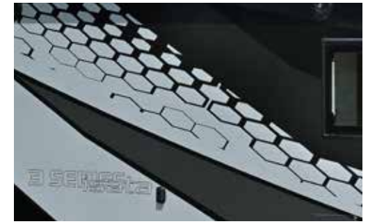
Cut & Buffed Premium Full-Body Paint with Diamond Shield

Drive with confidence knowing your tires are safely inflated.