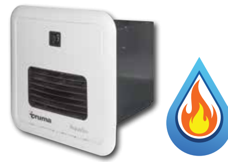
On-Demand Water Heater Never run out of hot water again with the state-of-the-art Truma®

Progressive Dynamics converter with the patented 4-stage Charge Wizard® system has been shown to increase the battery life by 2 to 3 times or more.