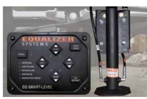
Automatic, 4-Point Leveling Jacks with Bluetooth Smart Phone App Control