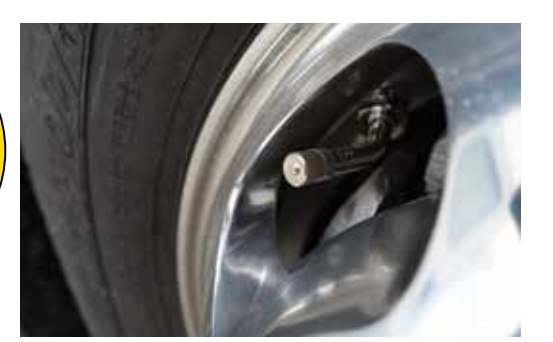
Tire Pressure Monitoring System with Metal Valve Extensions

better driving comfort, performance, and safety.