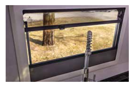
Dual-Pane Acrylic Windows with Built-in Day/Night Shades

With a built-in heater, these batteries can charge at temperatures as low as -20°C.