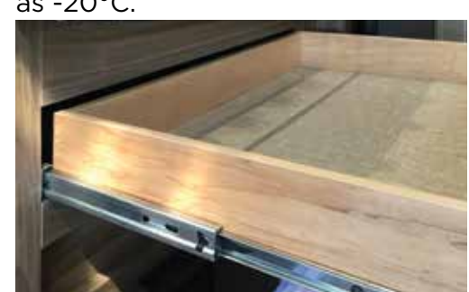
Soft-Close Residential Drawer Guides

Heat pumps take the chill out of the air without running the propane furnace.