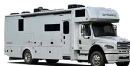
Platinum (Single Color Full Body Paint)