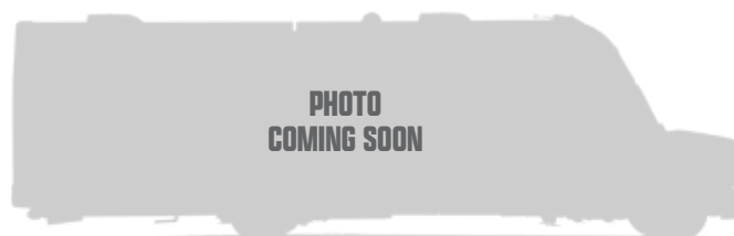
Platinum (Single Color Full Body Paint)