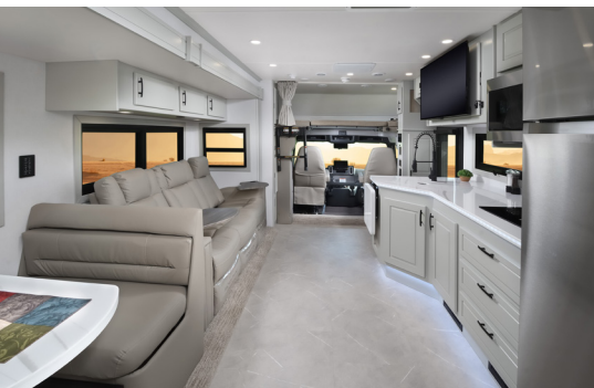
34KD shown with Mindful Gray cabinetry and Milano II décor.