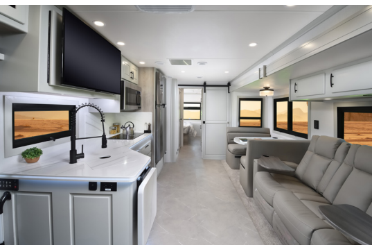
34KD shown with Mindful Gray cabinetry and Milano II décor.