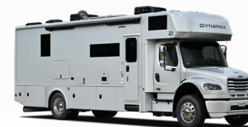
Platinum (Single Color Full Body Paint)