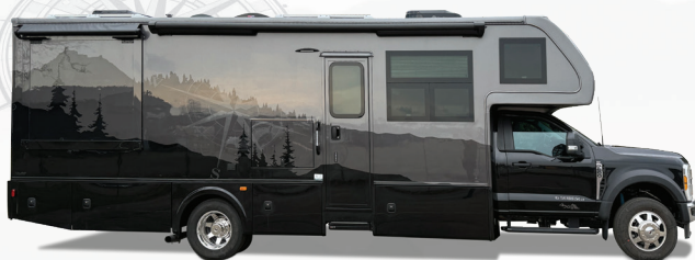
Shown in Xplorer Dark Full Body Paint. Additional Full Body Paint Options TBD.