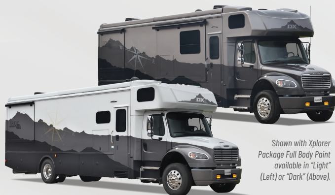
Shown with Xplorer Package Full Body Paint available in "Light" (Left) or "Dark" (Above).

Tested and developed for over a decade in the Canadian Rockies