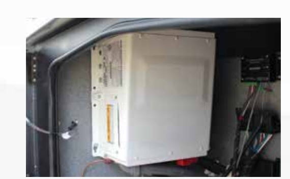
3,000W Hybrid Pure Sine Wave Inverter/ Charger (3,500 Peak Watts)

Provides enhanced comfort with better heat dispersion.