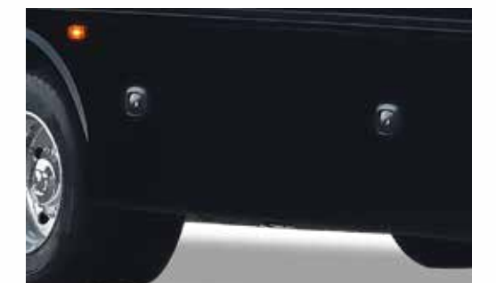
Slam-Latch Baggage Doors

Features a powerful battery charger to run larger loads from AC power or the batteries.