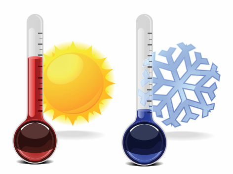
Dual 15k-BTU Air Conditioners with Heat Pumps

Take the chill out of the air without using LP.