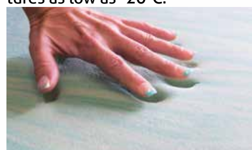
Gel-Infused Memory Foam Mattress

With a built-in heater, these batteries can charge at temperatures as low as -20°C.