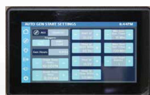
Automatic Generator Start

The "Soft-Close" feature keeps drawers closed during travel without plastic latches.