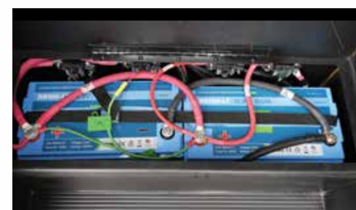
Dual Low-Temp Lithi um Auxiliary Batteries (200aH Total)

With a built-in heater, these batteries can charge at temperatures as low as -20°C.