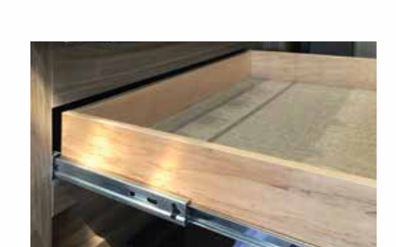
Soft-Close Residential Drawer Guides

Our heavy-duty aluminum doors feature metal slam latches.