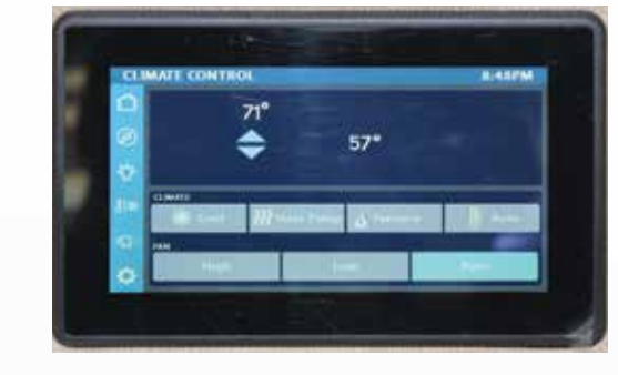
Multiplex Wiring Touch screen command center,

Omnidirectional VHF/UHF OTA, FM, and SIM Card Port.