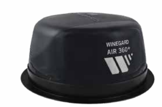
Winegard AIR 360+ with Gateway Router WiFi Extender, 4G LTE,

Each Isata 5 comes with an LP quick connect for use with a portable grill.