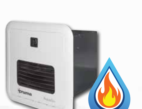
On-Demand Water Heater

Safely and effectively measures your tongue weight while towing.