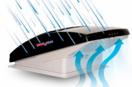
MaxxAir Fans Each standard fan features a built-in rain cover.