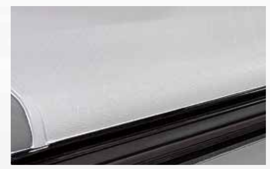
Fiberglass Roof This crowned, one-piece, fiberglass roof is more durable and easier to maintain than TPO or rubber.