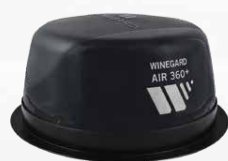
Winegard AIR 360+ with Gateway Router Omnidirectional VHF/UHF OTA, FM, and SIM Card Port.