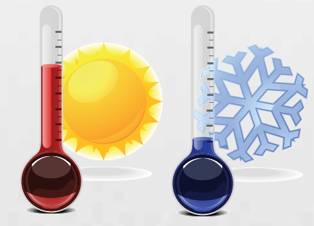
15k BTU Air Conditioner with Heat Pump

Power your AC devices without shore power or running the generator.