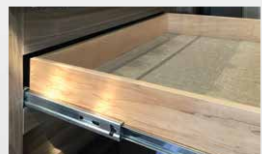
Soft-Close Residential Drawer Guides

This gel-infused memory foam mattress provides enhanced comfort with better heat dispersion.