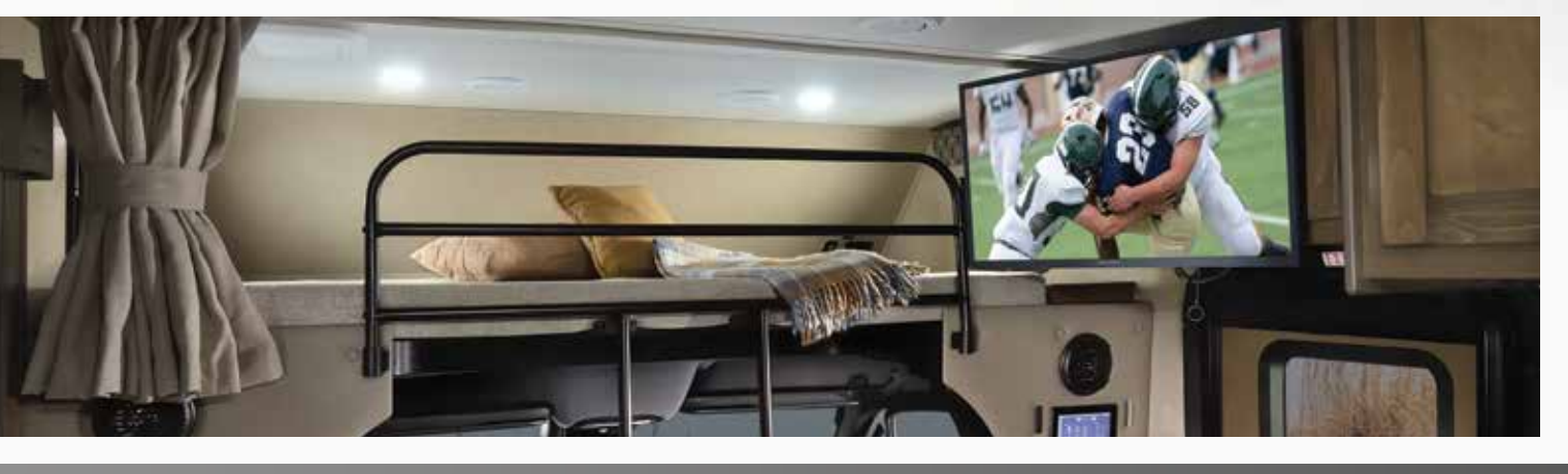
Cab-Over Bunk Option

Touchscreen Command Center, Bluetooth App Control, Back-lit Switch Panels, and TruTank Level Monitoring (measures tank levels in 5% increments).