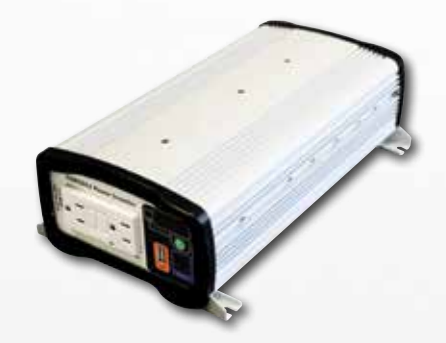
2000W Pure Sine Wave Inverter

Power your AC devices without shore power or running the generator.