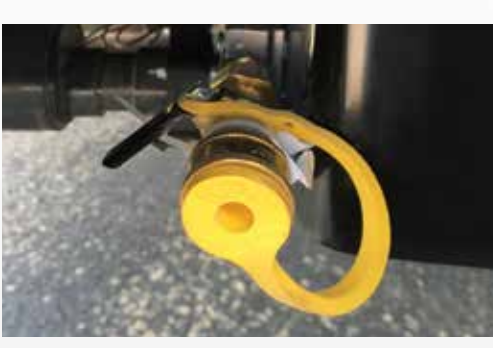
LP Quick Connect Each Isata 3 comes with an LP quick connect for use with a portable grill.