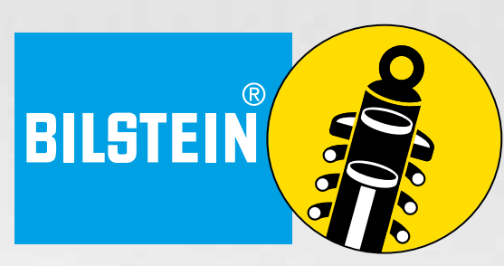
Bilstein Gas-Charged Rear Shock Absorbers

Never run out of hot water again with the state-of-the-art Truma® AquaGo™ on-demand water heater.