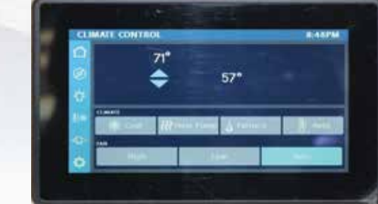
Firefly Multiplex Wiring

10.25" Touch Screen with Smart Wheel Controls, Built-in Navigation, Apple CarPlay/ Android Auto, and "Hey Mercedes" Voice Control.