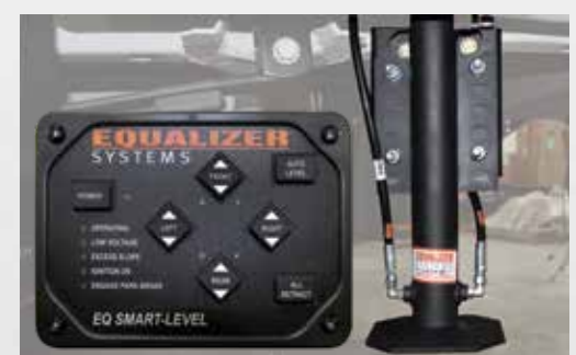
Automatic, 4-Point Hydraulic Leveling Jacks with Bluetooth Smart Phone App Control

Dual-Pitch, armless awning retracts automatically in high winds.