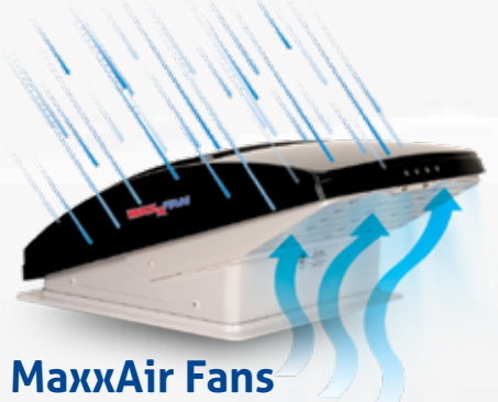
Each standard fan features a built-in rain cover.