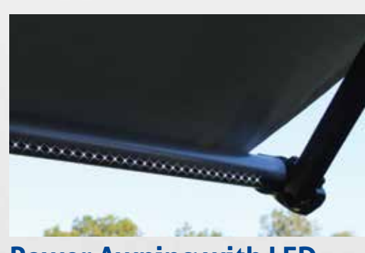
Power Awning with LED Light Strip

The "Soft-Close" feature keeps drawers closed during travel without plastic latches.