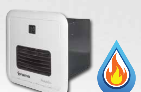
On-Demand Water Heater

Progressive Dynamics converter with the patented 4-stage Charge Wizard® system has been shown to increase the battery life by 2 to 3 times or more.