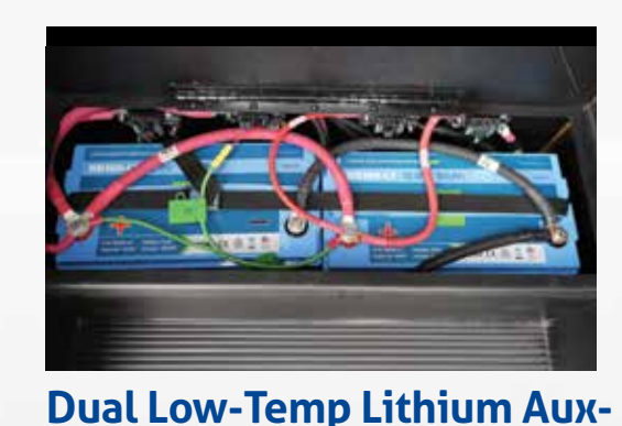
iliary Batteries (200aH Total) With a built-in heater, these batter- WiFi Extender, 4G LTE, ies can charge at temperatures as low as -20°C.