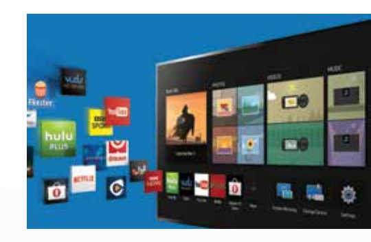
Home Theater System Just like home, this system features a sound bar and Bluetooth® connectivity.