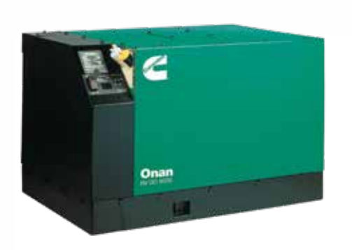
8kw Onan Diesel Generator

Includes auto transfer switch (Mounted on isolator pads) and automatic generator start.