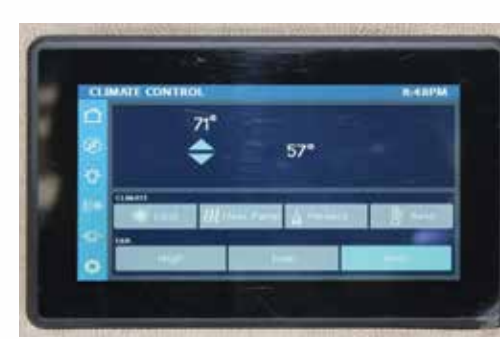
Multiplex Wiring Touch screen command center, back-lit switch panels, and Bluetooth smart phone app control