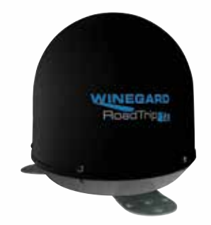
Winegard In-Motion T4 Satellite