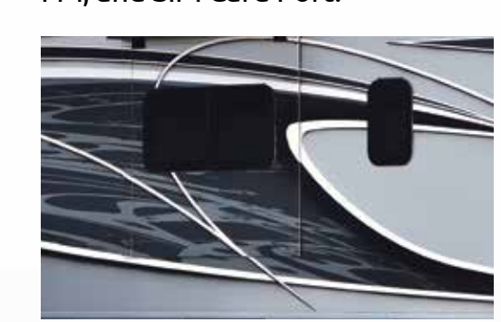
Cut & Buffed Premium Full-Body Paint with Diamond Shield

Omnidirectional VHF/UHF OTA, FM, and SIM Card Port.