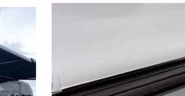
Fiberglass Roof This crowned, one-piece, fiberglass roof is more durable and easier to maintain than TPO or rubber.