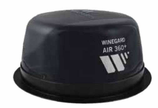
Winegard AIR 360+ with Gateway Router WiFi Extender, 4G LTE,

Omnidirectional VHF/UHF OTA, FM, and SIM Card Port.