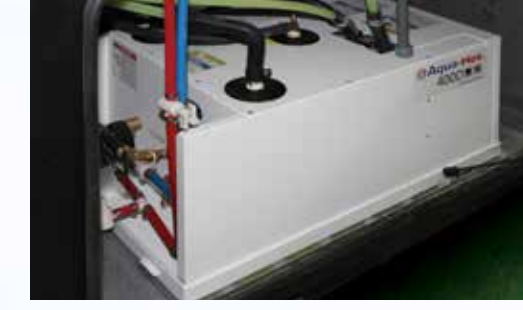
Aqua-Hot 450D Diesel System with Engine Pre-Heat

High/Off/Low braking dash switch for optimal performance.