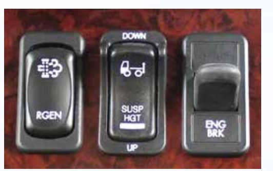
Dual-Stage C-Brake by Jacobs

The sharpest paint job on the road with four color options.