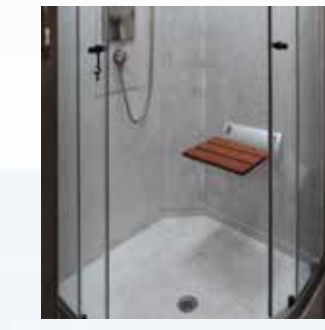
Solid Surface Shower with Glass Door, Skylight & Fold-Down Teak Seat The comforts and look of your